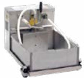
F662A9 SHORTENING FILTER