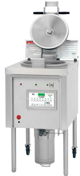
PF46 & PF56 COLLECTRAMATIC® HIGH EFFICIENCY FRYER

Ventilation required. Check local codes.